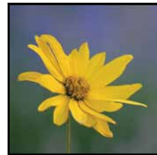
Showy Golden Eye