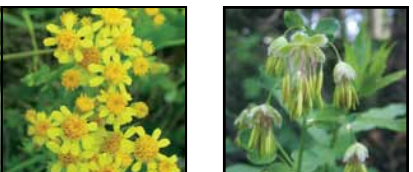
Alpine Groundsel Fendler's Meadow Rue