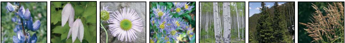
Silvery Lupine Western Clematis Grey Aster Everywhere As- Quaking Aspen Engelmann Spruce Bluejoint Reedgrass