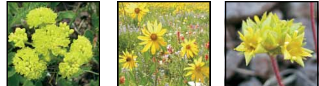
Sulphur Buckwheat One-Head Sunflower Gordon's Ivesia

Websites with information on native plant species: Utah Native Plant Society: www.unps.org Jordan Valley Water Conservancy District: www.jvwcd.org Intermountain Native Plant Growers: www.utahschoice.org For info. on seed propagation: www.backyardgardener.com (click 'Propagation' on the left)