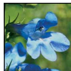
Rocky Mt. Penstemon