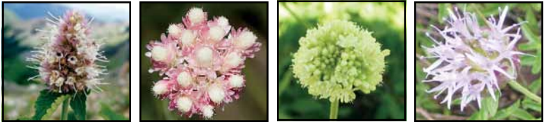
Nettleleaf Horsemint Rosy Pussytoes Wyeth's Buckwheat Coyote Mint

Websites with information on native plant species: Utah Native Plant Society: www.unps.org Jordan Valley Water Conservancy District: www.jvwcd.org Intermountain Native Plant Growers: www.utahschoice.org For info. on seed propagation: www.backyardgardener.com (click 'Propagation' on the left)