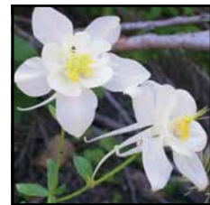
CO Alpine Columbine