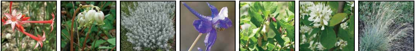
Scarlet Gilia Sidebell Wintergreen White Sagebrush Low Larkspur Mt. Snowberry Serviceberry Bluebunch Wheatgrass