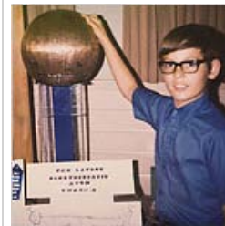
Calling All Cool Nerds