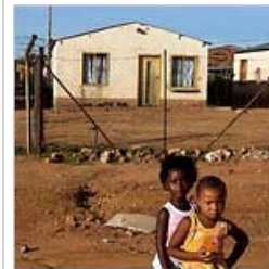
Zimbabwean Violence Reappears in South Africa