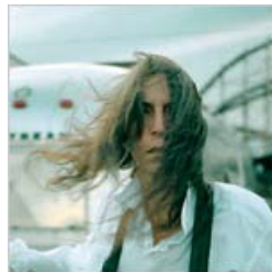
A Legend as Muse: Patti Smith Fills Role