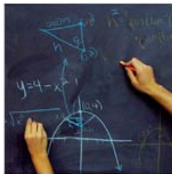
Room for Debate: Too Many A.P. Classes?