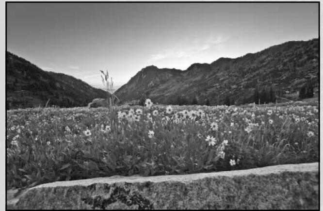
Complements of Richard Grossen

Pika are cousin to rabbits and live in rocky mountain areas and boulder-covered hillsides, usually at elevations of between 8,000-13,000 feet. This one was seen foraging in Albion Basin.